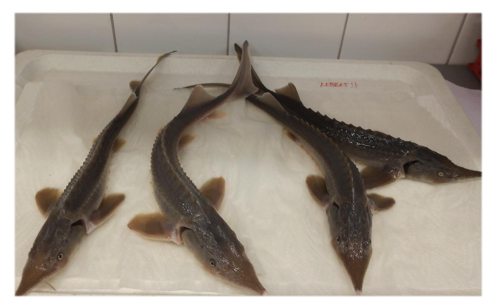
Table1. Siberian sturgeon (Acipenser baerii)