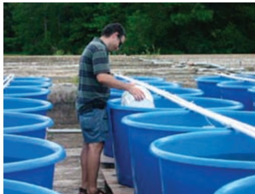
Author stocking yellow perch into tanks.