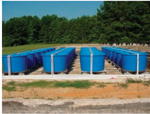
Tank system at North Auburn Fisheries Station used for the experiment.

Temperature had a significant effect on growth rate. Absolute growth when temperature was less than 20°C was significantly less than AG when temperature was more than 20°C (Table 1). Such results suggest that winter temperatures in Alabama are conducive to yellow perch growth. Average water temperature in the pond used for the present study did not drop below 4.5°C during the winter of 2003, although the surface froze for two days in early February, and temperatures started rising above 20°C as early as 27 March. Temperatures in central Wisconsin did not rise to 20°C until late June. 3 Ponds in Wisconsin are usually covered with ice from January through 15 March and temperature rises to circa 10°C around the end of April. 4 Aquaculturists in southern states who raise tropical and temperate species usually have fallow ponds during winter months. Most tropical and temperate species such as tilapia and penaeid shrimp re-