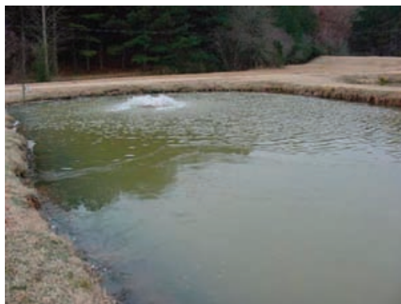
Pond through which water was circulated.

One remedy to the low winter temperatures in the NCR is to culture yellow perch in warmer southern climates. The caveat is that summer temperatures in southern states are higher than optimum for the fish. The solution would be to winter the fish juveniles in the south and grow them out in the northern states. Fish relocation of this sort is not new in aquaculture. Diadromous fishes are generally spawned in one location and then transported to another for growout. Cage cultured fishes are grown to specific sizes in ponds or recirculating systems before being stocked into cages. The