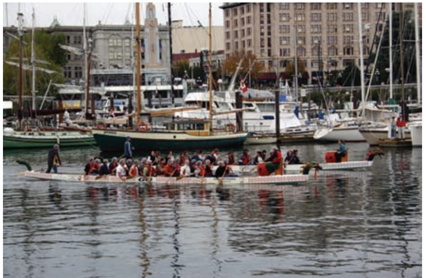
The competing dragon boats head across Victoria Harbor.

A student field trip was scheduled for Friday. As a student of aquaculture, it was a pleasure for me to have the opportunity to participate in the field trip. A bus took us to a facil-