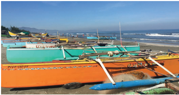
As the Philippines is surrounded by water, fishing villages are common throughout the country. This is a fishing village in the municipality of Binmaley in Pangasinan, which is located at the northern part of the Philippines.