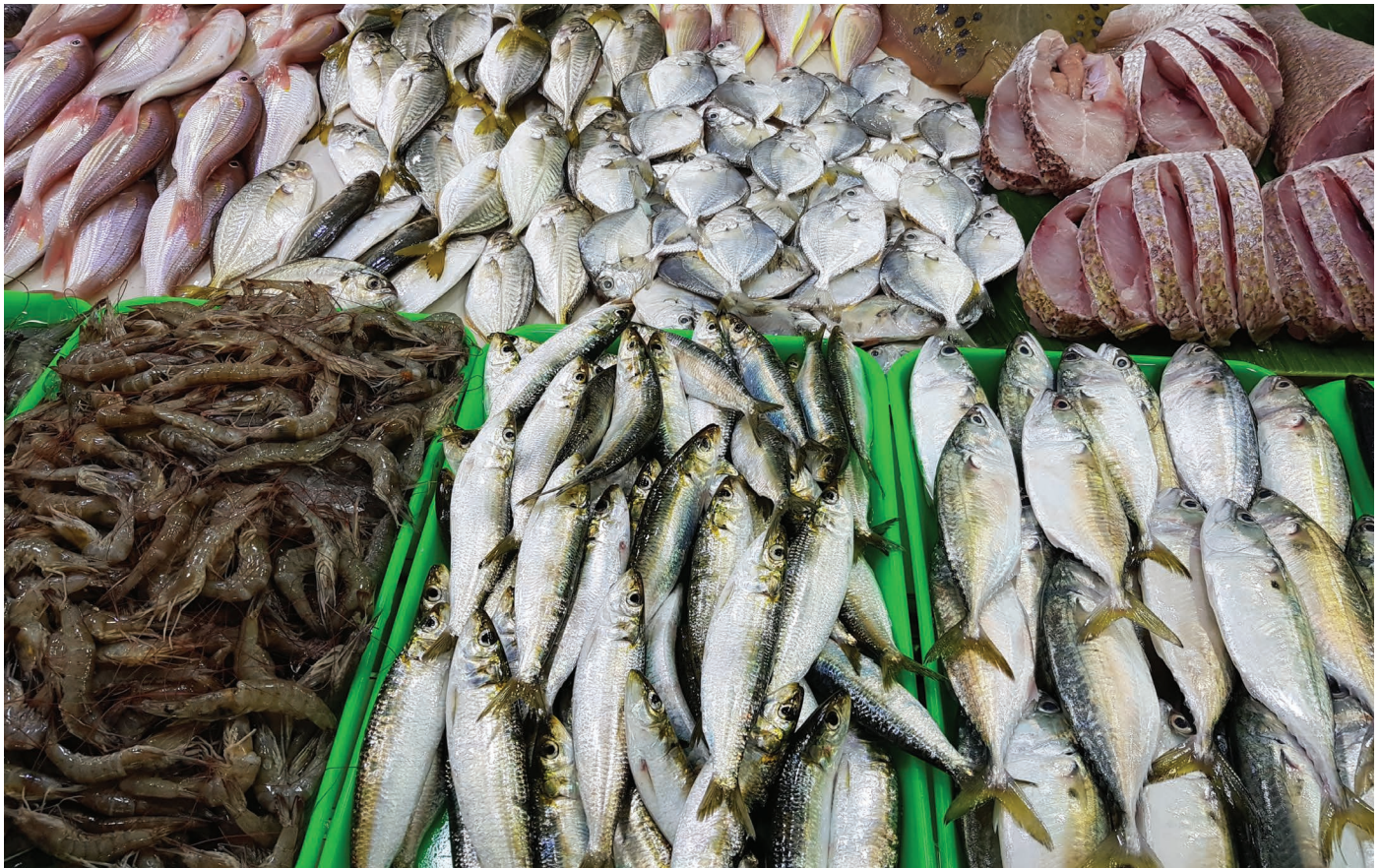
In local public wet markets in the Philippines, wild-captured and aquacultured fish, crustaceans and plants are sold to avid consumers (Photo: J.A. Ragaza).