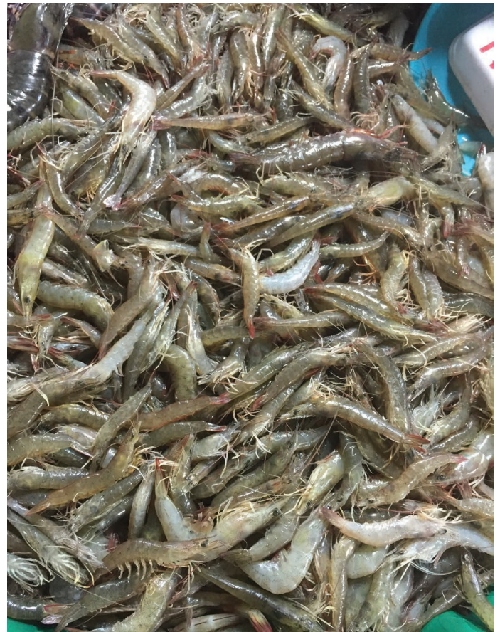
Culture of different species of shrimps has been facing the challenge of production loss due to various diseases.

aquaculture on ecosystems are: 1) the proliferation of invasive species, 2) eutrophication of waters by effluents from the production system, 3) conversion of vulnerable and valuable natural ecosystems for aquaculture use, 4) transmission of diseases and 5) pressure on wild fish populations for production of fishmeal (Diana 2009).