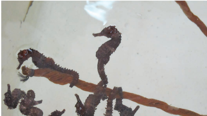
Seahorse farming by the AQD of SEAFDEC aims to improve broodstock reproduction and survival and growth of juveniles.