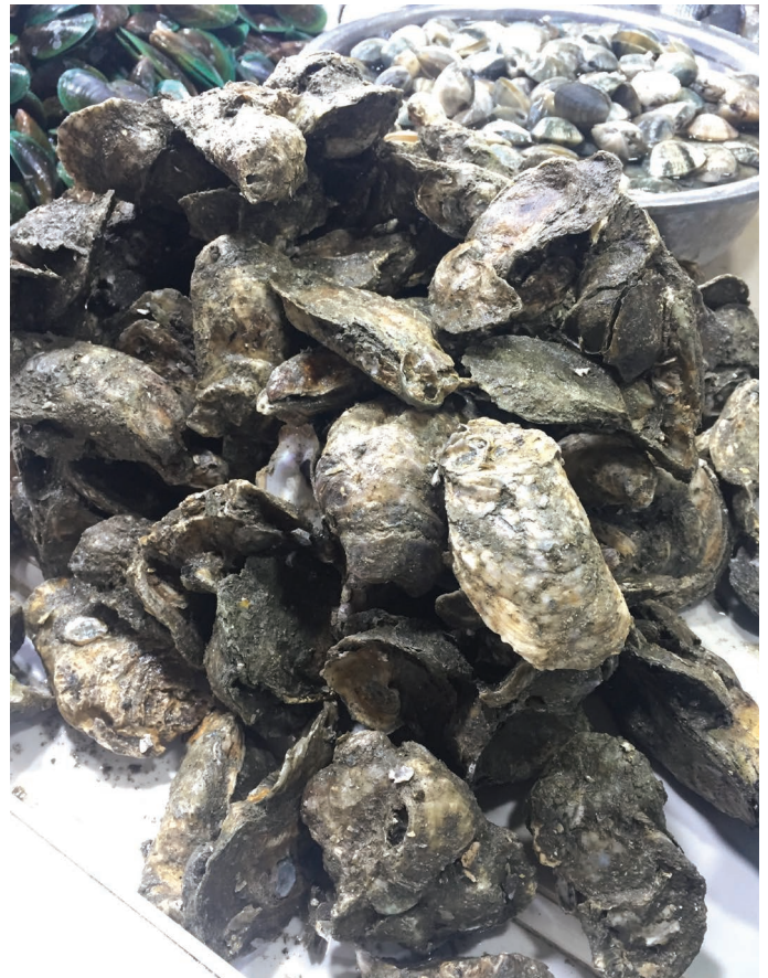
Oysters and mussels account for more than 65 percent of aquaculture production in the Philippines.

milkfish Chanos chanos ; 227,815 out of the total 323,629 t (70 percent) produced in these environments are milkfish (DA-BFAR 2015). Milkfish production also dominates brackishwater fish cages and fish pens. Milkfish also accounts for most of the production in marine fish pens at 104,924 out of 105,606 t or 99 percent. Tilapia production comprises 142,339 out of 147,569 t (96 percent) of freshwater fish ponds and tops all other freshwater systems.