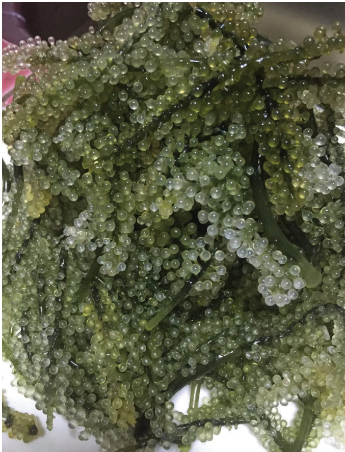
Philippine mariculture is primarily seaweed farming. Caulerpa lentillifera , commonly known as sea grapes, is grown on several seaweed farms in the country.