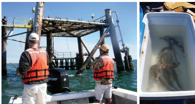
FIGURE 3. Collection of adult wild pigfish near an oil platform (right) and transportation back to the facility using an ice chest with supplemental oxygen (left).

Eggs were first collected approximately one month after capture and 16 natural spawns occurred over the next 34 days. Spawn sizes ranged from 2,200-110,000 floating, viable eggs. Mean egg