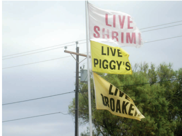
FIGURE 1. Bait stands employ a system whereby different colored flags indicate to consumers the types of live bait available at a particular time.

During the last several years, researchers at the University of Texas at Austin's Marine Science Institute Fisheries and Mariculture Laboratory (FAML) have been investigating the potential for marine baitfish aquaculture. With nearly 595 km of coastline and an increasing population, saltwater fishing trends in Texas highlight the prospects for baitfish aquaculture near the Gulf of Mexico. Direct expenditures on recreational saltwater angling in Texas were US$ 1.9 billion in 2015, with an overall economic impact of US$ 3.9 billion (National Marine Fisheries Service 2017). The number of recreational saltwater anglers and guides in Texas is increasing, and consequently, the demand for live bait has been increasing as well. Commercial landings of live baits increased by 53 percent over 8 years, from US$ 3.4 million in 2009 to US$ 5.3 million in 2016 1 . Although shrimp are commonly used as live bait, several species of marine finfish are also used. Atlantic croaker Micropogon undulatus , pigfish Orthopristis chrysoptera , mullet