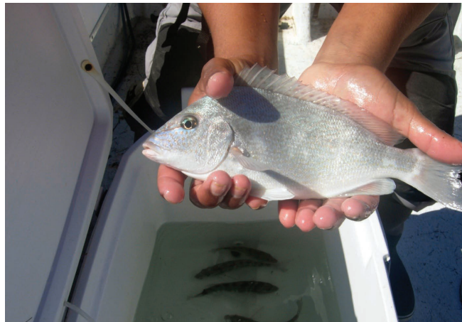
FIGURE 2. Adult wild-caught pigfish.

Mugil cephalus and mud minnows Fundulus grandis are the primary species sold at bait stands on the Texas Gulf coast (Texas Parks and Wildlife Department data). The most popular marine baitfish in Texas, pigfish and Atlantic croaker, become available to anglers in June each year. They are harvested for three months or so until they become too large for anglers to use effectively. As a result, monthly sales of these fishes can be 10 to 20 times greater during June, July, and August than during March, April, October and November.