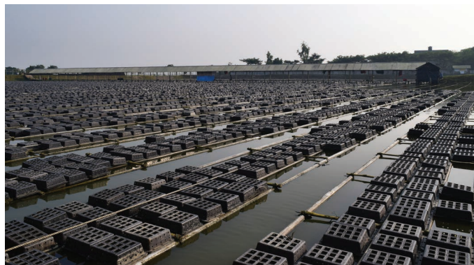
FIGURE 2. The largest land-based soft-shell crab farm in Shyamnagar, Satkhira, Bangladesh (Photo: Md. Mojibar Rahman).

was initiated in Cox's Bazar in 2010 and then gradually expanded into the Satkhira region on a limited scale (Islam et al. 2015). Approximately 39 farms are currently in operation in coastal areas in the Satkhira district. The farms operate soft-shell crab production systems in which crabs are stocked individually in small perforated plastic boxes (Shelley and Lovatelli 2011). Depending on production capacity, 30 farms can be categorized as small, eight as medium and one as a large farm (Fig. 2), holding approximately 2,000-14,000, 33,000-200,000, and 600,000 plastic boxes, respectively, covering approximately 70-80 ha of coastal water bodies that were formerly used for shrimp farming. Most of these farms are owned by non-local affluent business people and lands are leased for at least five years tenure and jointly operated because substantial investment and large-scale management are required (Rahman et al. 2017). The main water sources for the farms are seawater