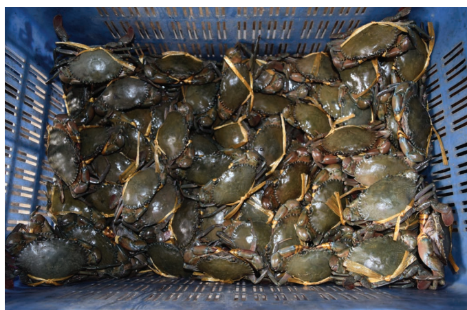
FIGURE 3. Stockable small-size crabs for soft-shell crab production.

Potential for areal expansion. Bangladesh has 710 km of coastline, with the world's largest mangrove forest (the Sunderbans),