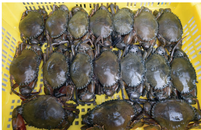
FIGURE 9. Soft-shell crabs from small farms ready for transport to a processing plant in Shyamnagar, Satkhira.

Secondly, the augmented demand for trash fish as crab feed is also generating environmental pressures in coastal areas. The price of these inputs is generally rising and at times supplies are unpredictable. These factors have contributed to a lack of business security and in some cases the failure of small-scale producers. For