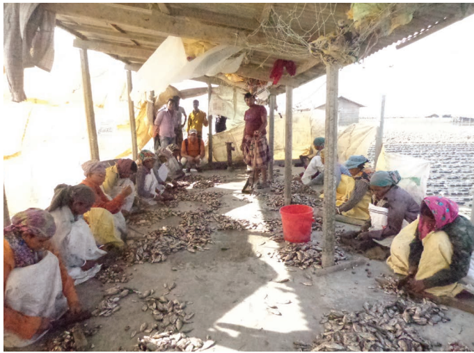
FIGURE 5. Women mince fish for feed in a soft-shell crab farm in Shyamnagor, Satkhira, Bangladesh.