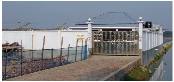
FIGURE 7. Mud crab hatchery and technology development in Shyamnagor, Satkhira.

Therefore, mud crab hatchery establishment (Fig. 7) and technological development for hatchery raised crablet production are urgently needed (Islam et al. 2015). Successful hatchery production can support a regular supply of seed crabs for grow-out culture systems to produce adequate numbers of properly-sized juveniles after the nursery phase. A sustainable and reliable supply of stockable crabs for soft-shell farms would thus reduce pressure on wild stocks