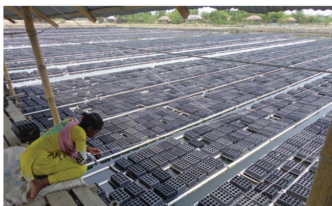
FIGURE 4. Women monitoring the molting status of crabs in cellular box soft-shell crab farm.

which is a richly biodiverse aquatic ecosystem (Rahman et al. 2017). Land in the coastal region is 28 percent very suitable, 62 percent moderately suitable and only about 10 percent marginally suitable for crab farming (Salam et al. 2012). There are about 275,509 ha of shrimp and prawn ghers (modified ricefields) in the coastal zone (FRSS 2017). Many of these water bodies are improperly used for aquaculture, as impacted by shrimp farming, leading to the propagation of pathogens and to environmental degradation (Karim and Stellwagen 1998). The intensification and exploration of crab aquaculture for fattening and soft-shell crab production can potentially make more sustainable use of these water resources.