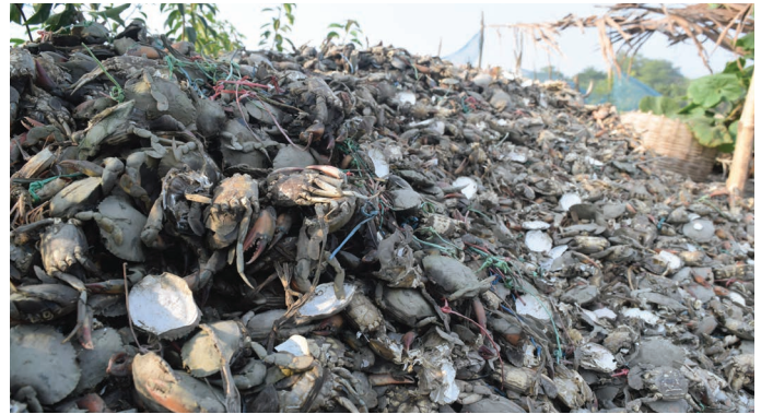
FIGURE 8. Plenty of wasted crab shells produced in soft-shell crab farms in Shyamnagor, Satkhira (Photo: Md. Mojibar Rahman).

(Perry et al. 2010). In this way, soft-shell crab production offers considerable potential for expansion and development in the scaling up of grow-out crab farming.